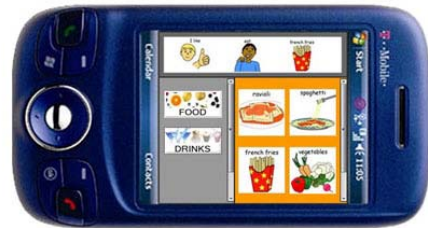
Figure 1a: Operational mode. Selection of image/images

selected images are combined. Then, clicking a button places the message in the middle of the screen and the handheld device goes into display mode. In display mode, the images are enlarged as much as possible (Figure 1b) and the touch-screen does not respond to touch anymore, allowing others to hold the device without changing the message.